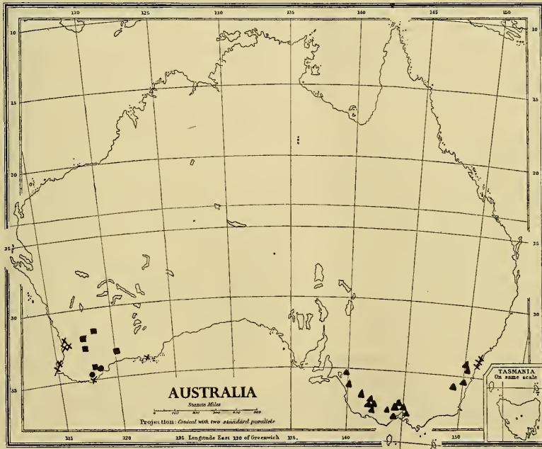
Fig. 3.—Map showing distribution of Pelargonium spp. P. drummondii , ●; P. rodneyanum , ▲; P. havlasae , ■; P. capitatum ×.

Synonymy: P. clandestinum L'Her. ex DC., Prodr. 1: 660 (1824) nom. nud. P. clandestinum L'Her. ex Hook. f., Flora N.Z. , 41 (1853). P. australe Willd. var. clandestinum (L'Her. ex Hook. f.) Hook. f., Handbook N.Z. Flora , 37 (1864). Erodium peristeroides Turcz. in Bull. Soc. Imp. Nat. Moscou , 36: 592 (1863).